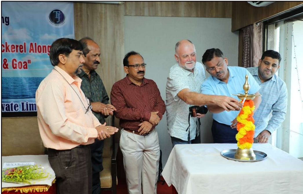
Lighting of Ceremonial Lamp

with lockdown in the country made it difficult for the company to implement the project as envisaged in the approved fishery action plan. This necessitated to revise the action plan several times. The Central Institute of Fisheries Technology (CIFT) Kochi, The Directorate of Fisheries Goa, Dept. of Fisheries Ratnagiri, College of Fisheries Ratnagiri and stakeholders from Goa & Maharashtra contributed significantly to move the project forward.