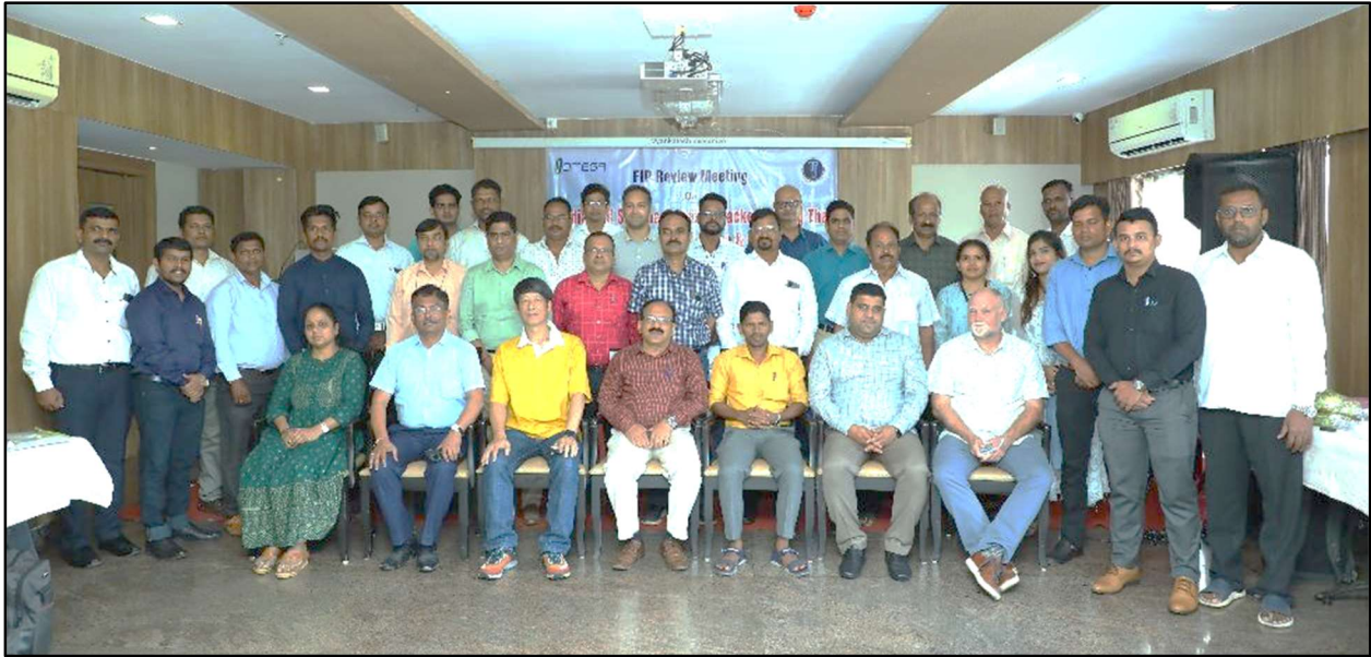
Group photo of participants

PROGRESS REVIEW WORKSHOP REPORT - APRIL 2023